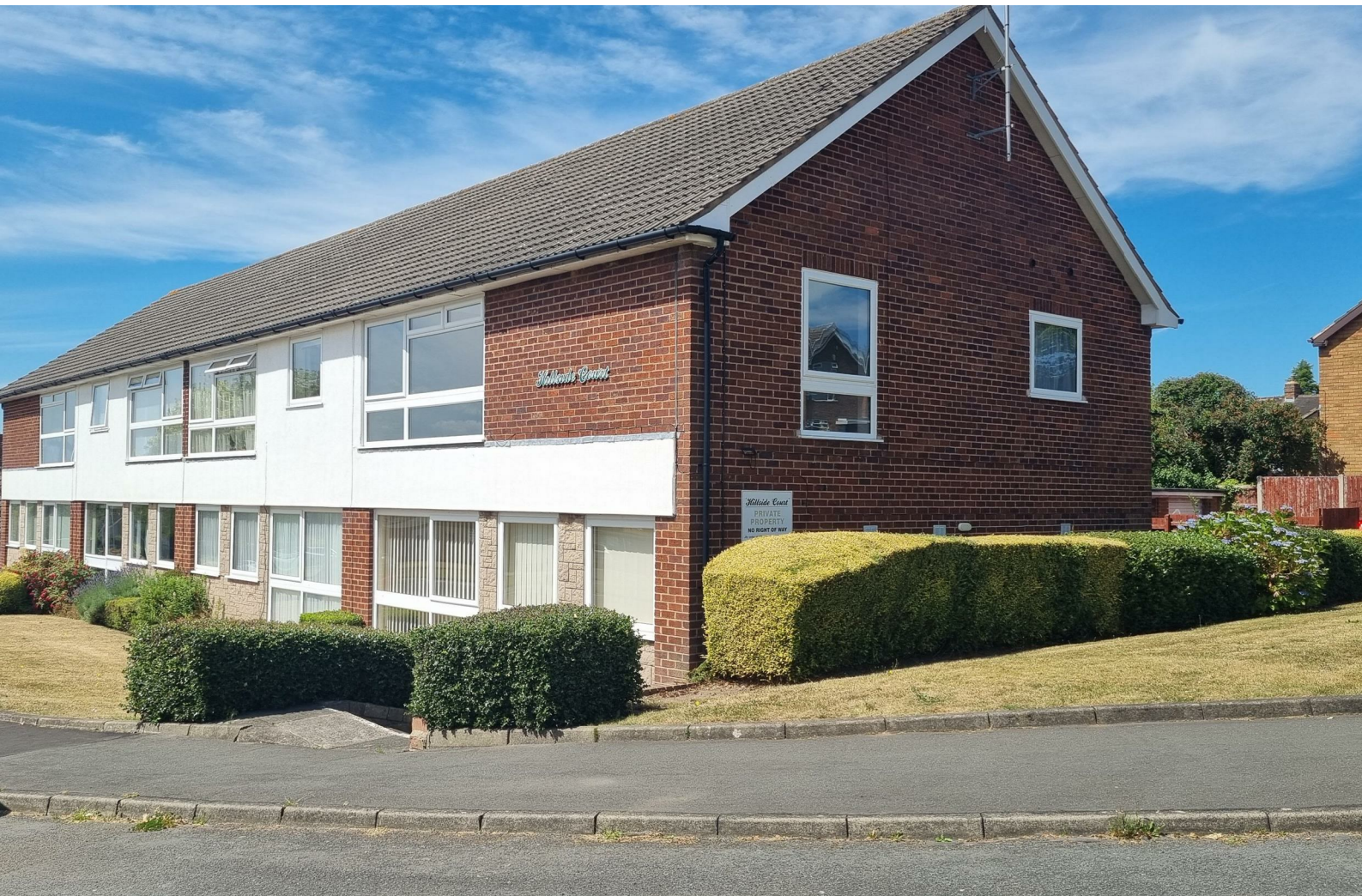
5 Hillside Court, Stourbridge, DY9 0TP